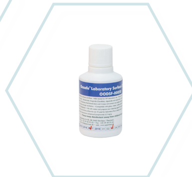
Product code: OODSF-00050 Oosafe® Laboratory Surface Disinfectant, 50 ml in bottle