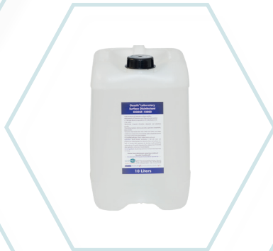
Product code: OODSF-10000 Oosafe® Laboratory Surface Disinfectant, 10 Liters refill container